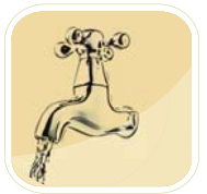
Pressurized water pumps