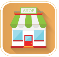
Gatehouse and shop