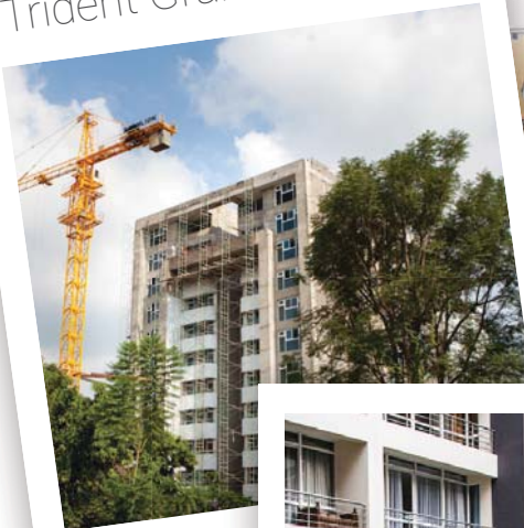
Trident Grand Riverside