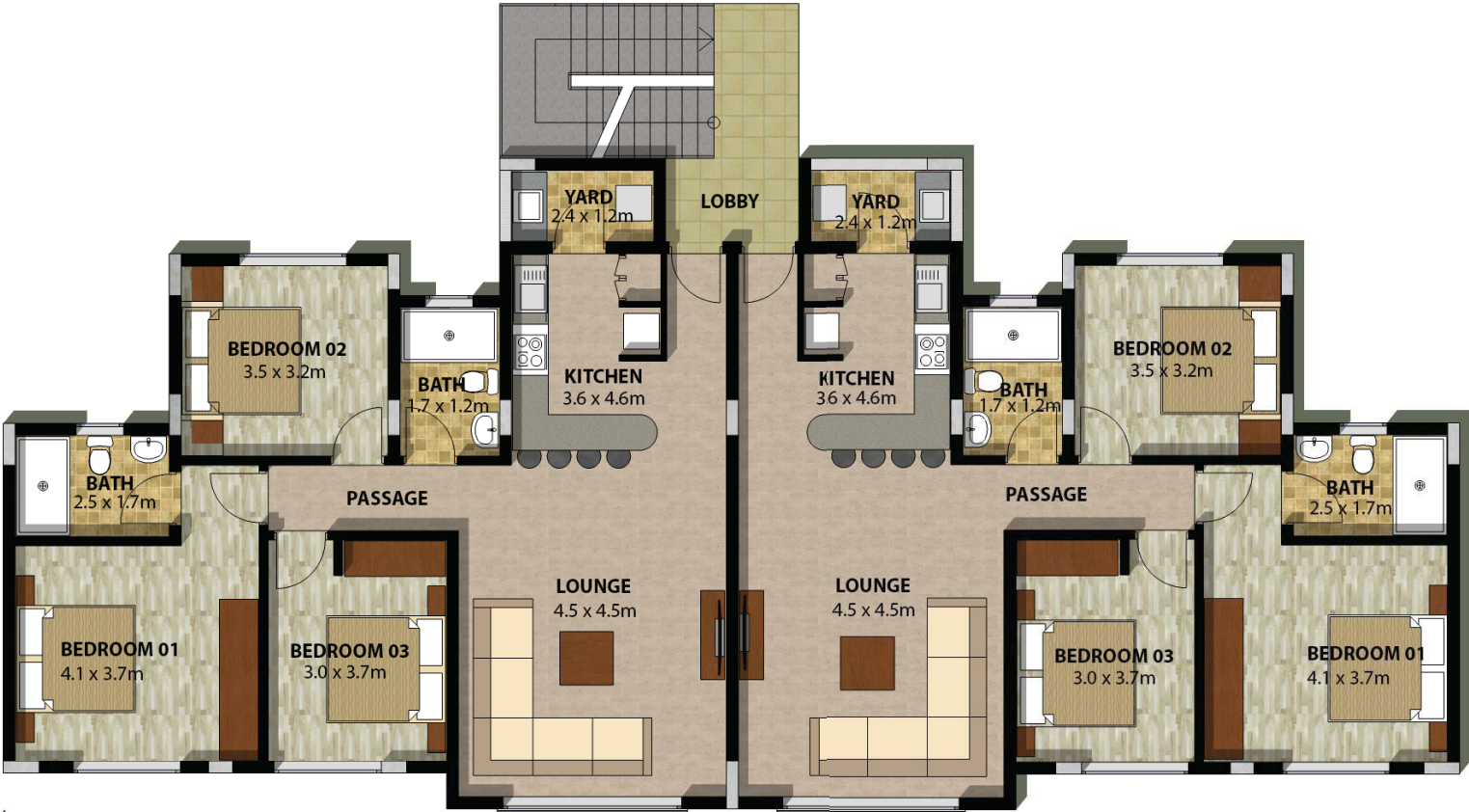
TYPICAL UNIT PLAN = 1060.78FT 2