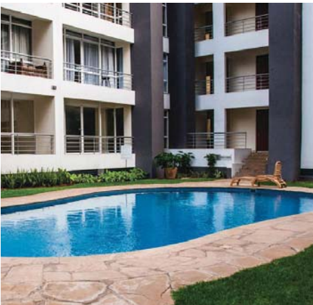
Trident Heights Riara