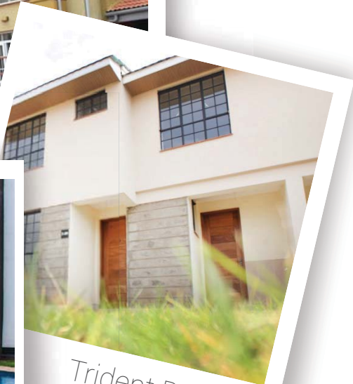
Trident Baraka Estate